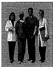
Medical, public health professionals, veterinarians, dentists, pharmacists, and other community members contribute to the success of Medical Reserve Corps